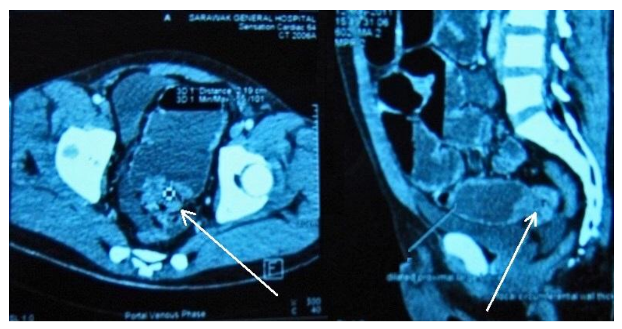
Fig. 1. Computed tomography scan of the abdomen & pelvis showing a circumferential sigmoid colon tumour (white arrow) causing large bowel obstruction

Extended bowel resection is often necessary as the ulcero-inflammatory changes involve a variable length of colon, ranging from 8 to 25 cm with an intervening normal colon of 2.5 to 35 cm length [12]. Failure to perform extended resection in critically ill patients with OC resulted in poor outcomes, often contributing to the patients death [5]. The proximal bowel should always be examined after transection [2]. Delayed diagnosis could lead to complications such as peritonitis. perforation. breakdown of anastomoses and bleeding as in our case [2]. It has been recommended to open the resected bowel during surgery to examine the proximal colon after transection [2.4]. If ulcers are seen, a frozen section examination of the proximal margin of the resected colon can be performed to determine the viability of tissues [4]. Otherwise, extended resection of the colon should be done until the healthy mucosal margin is achieved [2]. In our case, completion total colectomy was performed as it was considered risky to limit the extent of the colitis to what was seen endoscopically. There were copious amounts of blood clots that limited accurate assessment of the mucosa. It was fortunate that an ileocolic anastomosis was possible without untoward anastomotic complications.