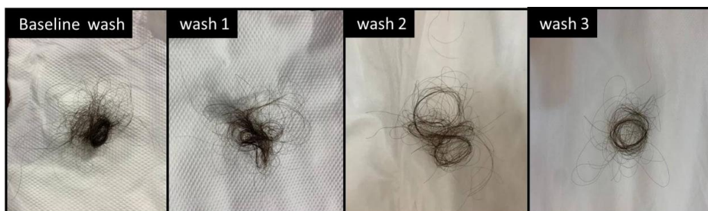
Fig. 1. Shed hair was cleaned, dried and collected on a white tissue paper post hair wash “Baseline, 1, 2 & 3 respectively and images were shared with the principal investigator for scoring by Hair Shedding Visual Scale