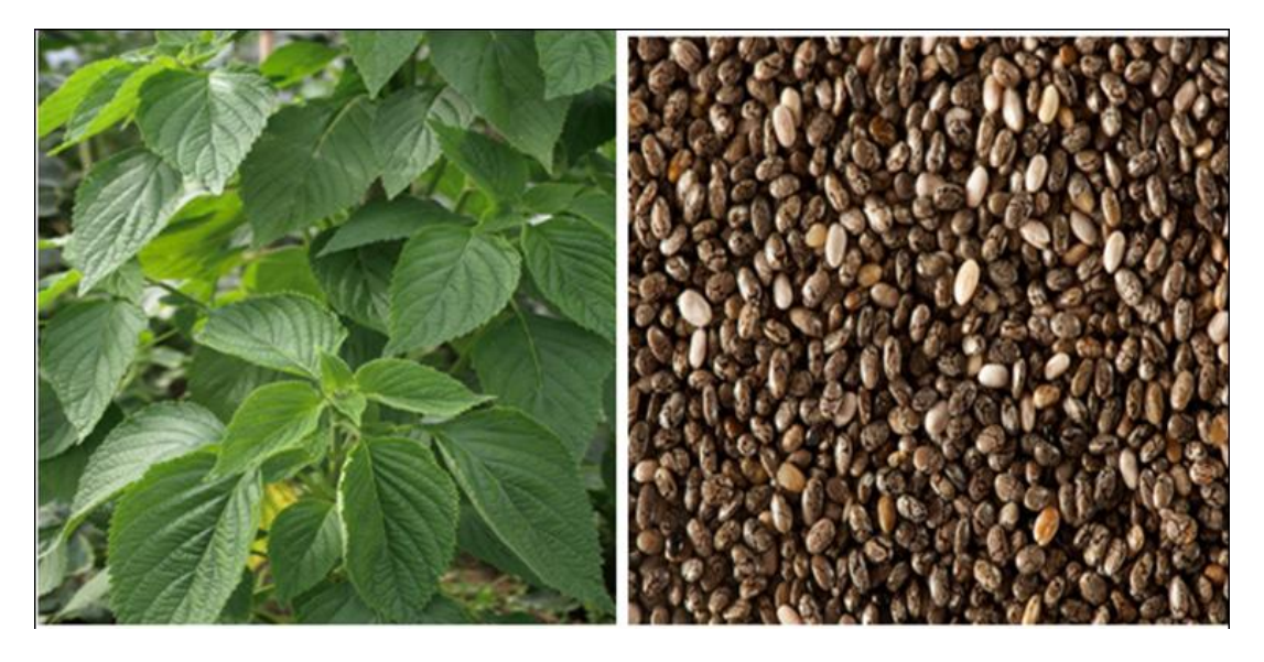
Fig. 1. Chia plant and its seeds [7]

that because of fatty acids that exist in a high percentage in Chia seeds, they are crucial for antimicrobial activity, antioxidants, and health. When used as a nutritional element, Chia seeds have yielded enormous positive benefits in terms of reducing the risk of diabetes and heart disease, promoting stronger muscles and bones and healthy skin, and supporting the digestive system [11-14]. In this study, the central purpose is to provide an overview of Chia seeds, with a particular emphasis on their medicinal properties.