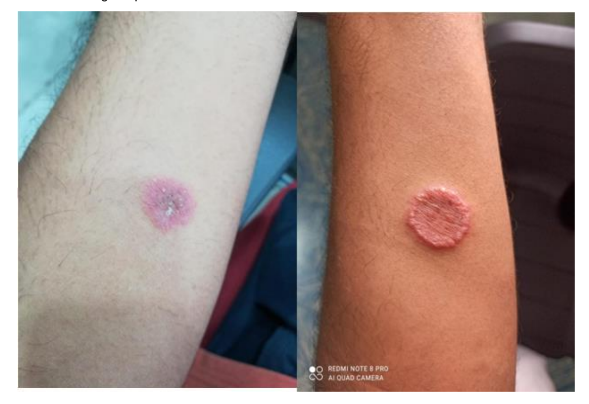
Fig. 1. Lesion seen on day 1 of appearance

GA. namely infiltrative (interstitial) pattern. palisading granuloma pattern, and an epithelioid nodule (sarcoidal granuloma, mixed) pattern, are known [1]. GA shows characteristic palisading granuloma, a pattern exemplified by stacked epithelioid histiocytes aligned around a central focus of mucin [2]. In some instances, histiocytes that are seen as a foci within the dermis can be distributed interstitially as strands, cords, or columns in other foci, i.e., between bundles of collagen. Synthesis of types I and III collagen also occur as a reparative response. Necrobiosis lipoidica is a common differential diagnosis of GA shows pan-dermal inflammation, linear arrays of histiocytes surrounding necrobiotic collagen and abundant plasma cells [9]. The presence of mucin and the absence of asteroid bodies or other giant cell inclusions also less favors sarcoidosis [2]. The lesions do not display scaling and are not accompanied by vesicles or pustules, which helps distinguish GA from tinea corporis [10]. In addition, hyphae can be visualized in a potassium hydroxide preparation from a suspected lesion tinea corporis and not in a lesion of GA [10]. Hansens disease is less likely in the absence of anaesthesia in the lesion and/or a normal peripheral nerve examination, especially in endemic regions of leprosy.