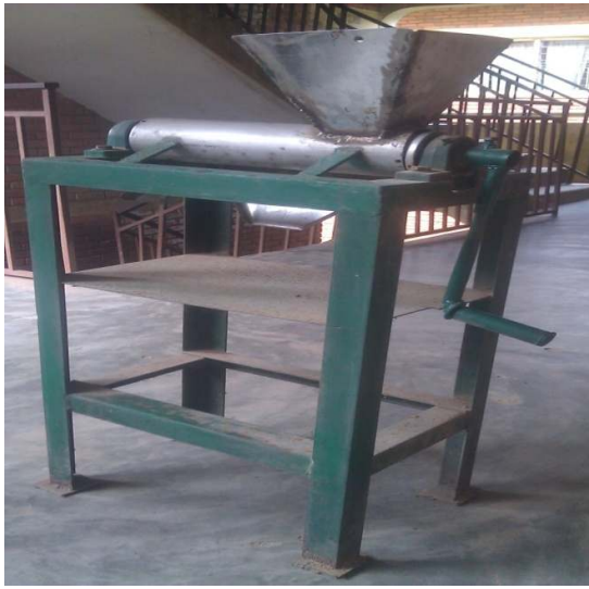
Fig. 3. Photograph of the manual fruit juice extractor