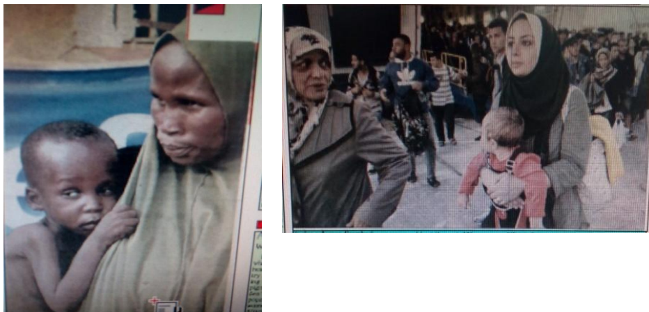
Fig. 2. Media image used portraying a Nigerian and Syrian Refugees published in a Daily Nation and Standard May 2015

Based on Kent, Daniell, Davis and Daigle [39] arguments that media frames and enables individuals to see certain things, Table 7 exemplifies images of immigration framed in relation to security issues (46%). This holds true as studies have cited civil wars and conflict as some of the major causes of migration. When Lippmann [40] argued that the images reported by the media remained in people's minds can certainly influence how immigrants are viewed. In this study immigrants were structured or were perceived as a threat to security in 24 (19%) of the newspaper articles (see Table 8). Nonetheless agenda setting theory provides insights into how media spread information and based on the theory, these agenda includes emphasize and frequency in which these issues are reported.