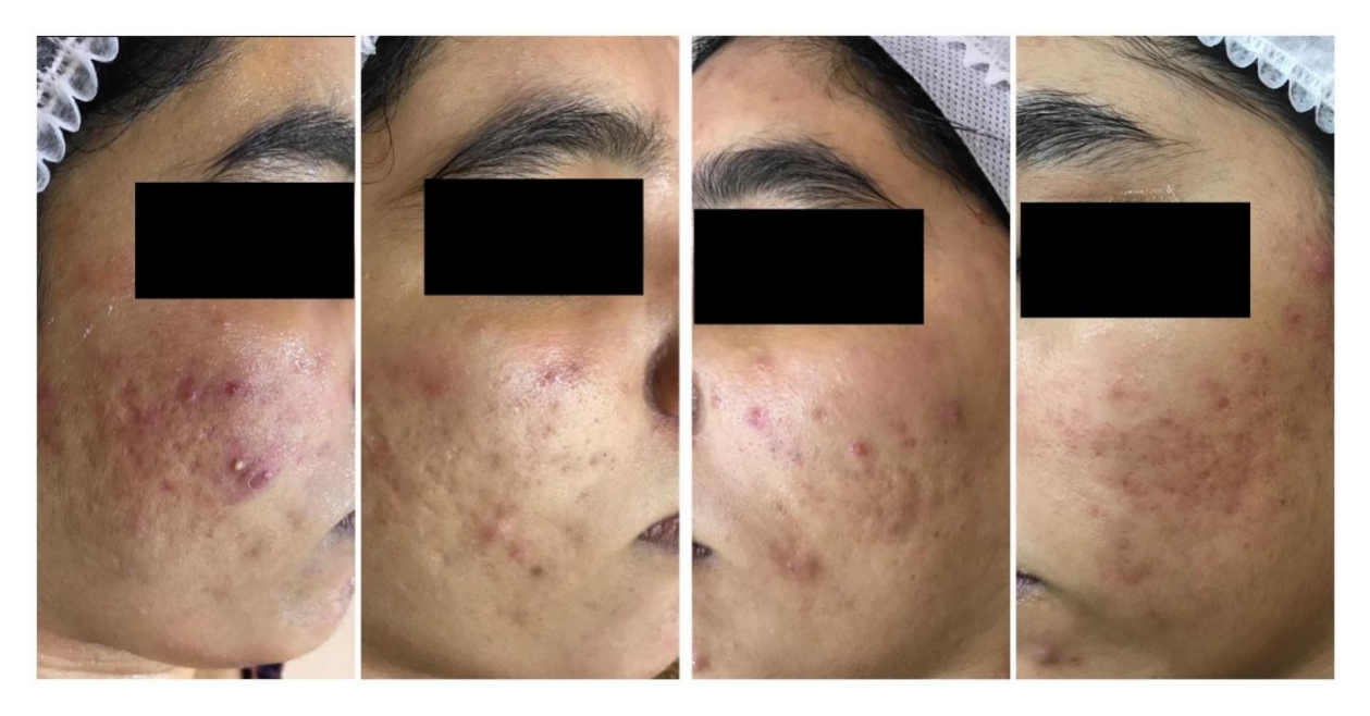
Image 4. Sample image of a female patient before and after treatment for 16 weeks

Patients with untreated acne are at risk for depression, suicide and other psychiatric or psychosomatic conditions [16]. Therefore, psychiatric or psychosomatic comorbidityshould be diagnosed before and not just duringisotretinoin treatment. It is important to observe suchpatients before and during the treatment in orderto record their mood changes and to identify whether adetailed investigation of