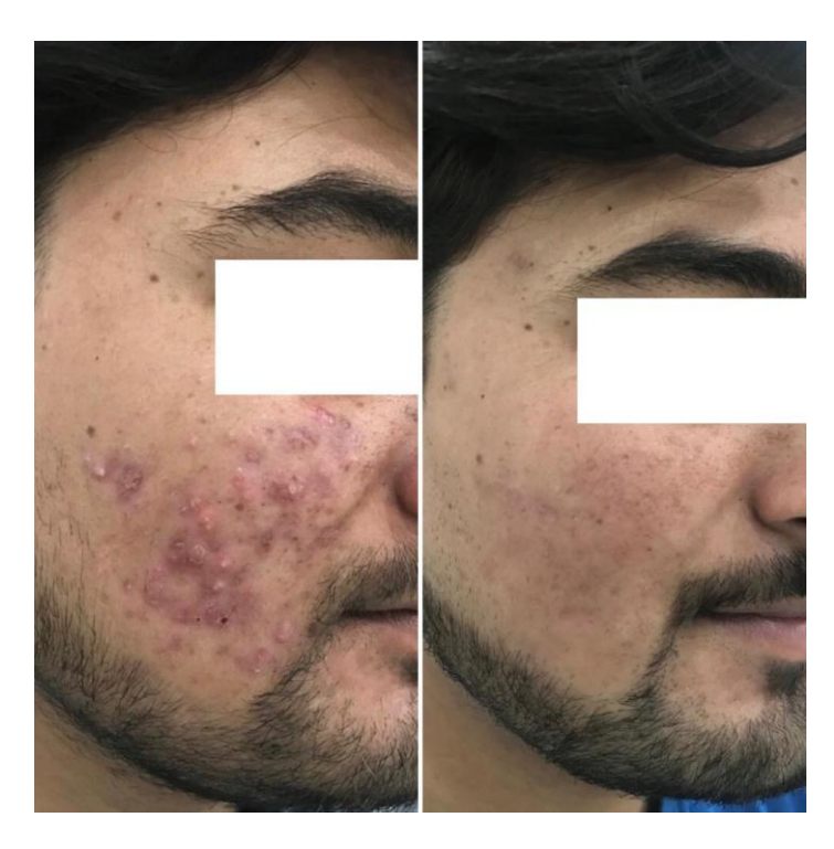
Image 3. Sample image of a male patient before and after treatment for 16 weeks

Swetha et al.; AJRDES, 4(4): 15-22, 2021; Article no.AJRDES.76150