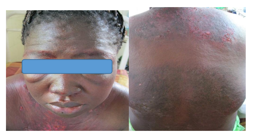
Fig. 2. Periorbital erythroedema during dermatomyositis