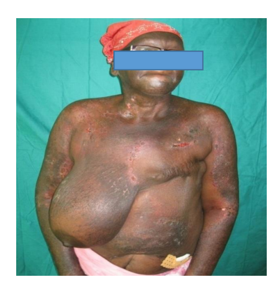
Fig. 4. Dermatomyositis + relapse of a right mammary neoplasia

Death was noted in 11 patients (19.64%) secondary to severe hyponatremia (1 case), respiratory distress of undetermined etiology (1 case) and pulmonary tuberculosis. In the other cases, they were dermatomyositis associated with cancer (n = 3).