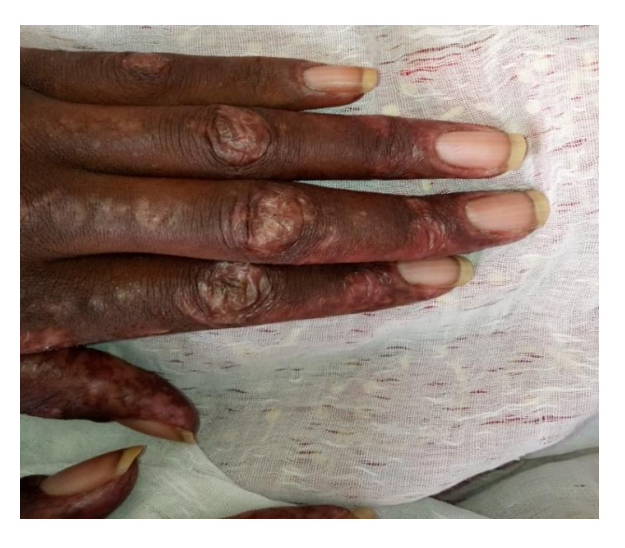
Fig. 3. Gottron's papules during dermatomyositis