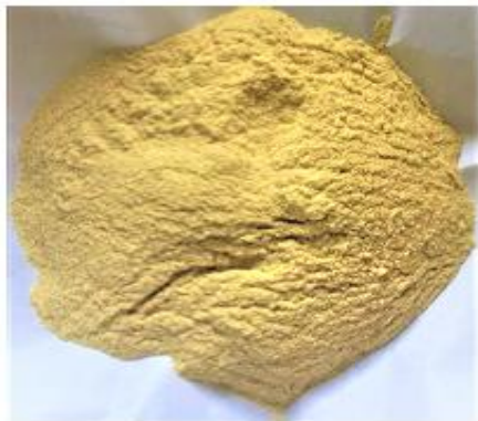
Plate 3: Jackfruit Seed Flour