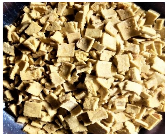
Plate 5. Formulated Breakfast Cereals