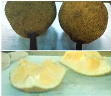
Plate 1: Jackfruit