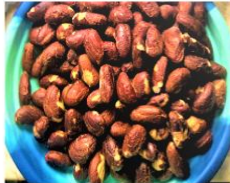
Plate 2: Dried Jackfruit seed