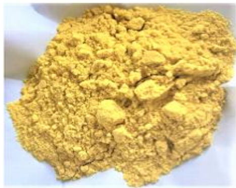
Plate 4: Maize Flour