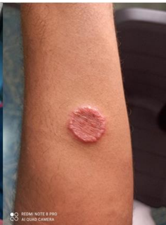
Fig. 2. Lesion as seen after one week