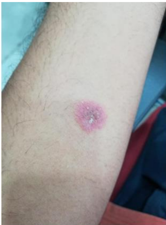
Fig. 1. Lesion seen on day 1 of appearance

GA, namely infiltrative (interstitial) pattern, palisading granuloma pattern, and an epithelioid nodule (sarcoidal granuloma, mixed) pattern, are known [1]. GA shows characteristic palisading granuloma, a pattern exemplified by stacked epithelioid histiocytes aligned around a central focus of mucin [2]. In some instances, histiocytes that are seen as a foci within the dermis can be distributed interstitially as strands, cords, or columns in other foci, i.e., between bundles of collagen. Synthesis of types I and III collagen also occur as a reparative response. Necrobiosis lipoidica is a common differential diagnosis of GA shows pan-dermal inflammation, linear arrays of histiocytes surrounding necrobiotic collagen and abundant plasma cells [9]. The presence of mucin and the absence of asteroid bodies or other giant cell inclusions also less favors sarcoidosis [2]. The lesions do not display scaling and are not accompanied by vesicles or pustules, which helps distinguish GA from tinea corporis [10]. In addition, hyphae can be visualized in a potassium hydroxide preparation from a suspected lesion tinea corporis and not in a lesion of GA [10]. Hansen's disease is less likely in the absence of anaesthesia in the lesion and/or a normal peripheral nerve examination, especially in endemic regions of leprosy.