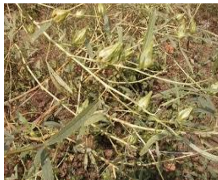
Fig. 2. Fresh roselle calyx