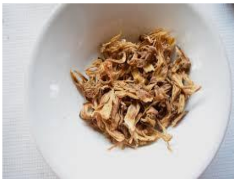
Fig. 1. Dried roselle calyx

It is popularly prepared by soaking it overnight in water and wood ash or by parboiling with wood ash. This is to neutralize the antinutrients and also reduce its acidity before it is used to prepare soup [7]. Although different research has been done on this plant, this research was conducted to compare the effect of fermentation on Hibiscus sabdarifa obtained from two geographical locations in Nigeria.