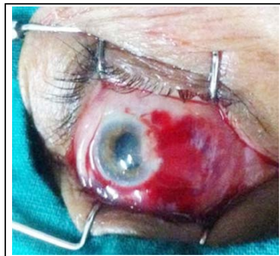
Fig 2: Peroperative: Bare Sclera to apply MMC.