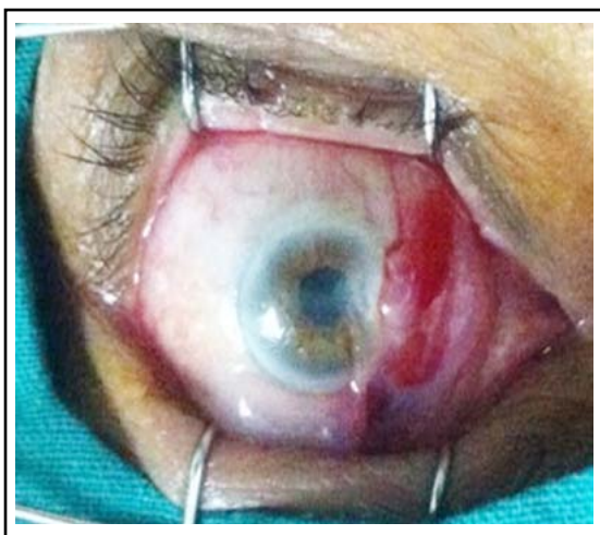
Fig 1: Peroperative: subconjunctival xylocaine 2% injected

The study was conducted at department of Ophthalmology, Ziauddin University Hospital, Keamari, Karachi from July 2013 to October 2013. The patients with primary pterygium with recurrent inflammation, impaired vision or cosmetic disfigurement were selected randomly for pterygium excision with either intraoperative MMC or conjunctival autograft. While those with recurrent pterygium, glaucoma, conjunctival scarring or dry eyes were excluded. All patients were allocated to two groups "A & B" at random and were operated as day case procedure. All the patients were explained regarding expected outcome with the use of MMC or Conjunctival Autograft. The detailed examination of anterior and